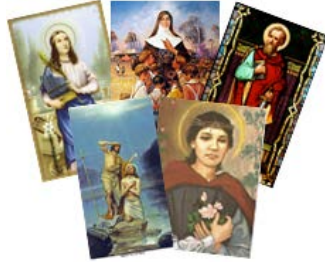
Saints, Heroes of our Faith!

During “Shipwrecked” Totally Catholic VBS, kids experience Scripture in fun and unforgettable ways through games, music, skits, crafts, Bible Adventures, World Missions, and great snacks!